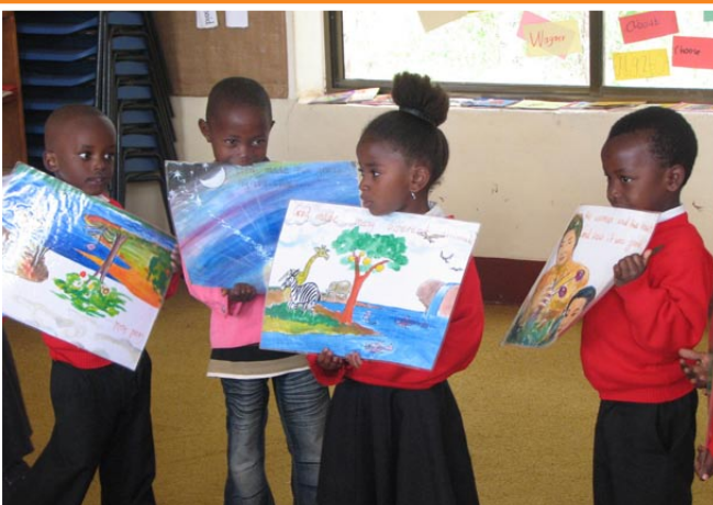
Kids presenting for parents day