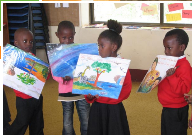
Kids presenting for parents day