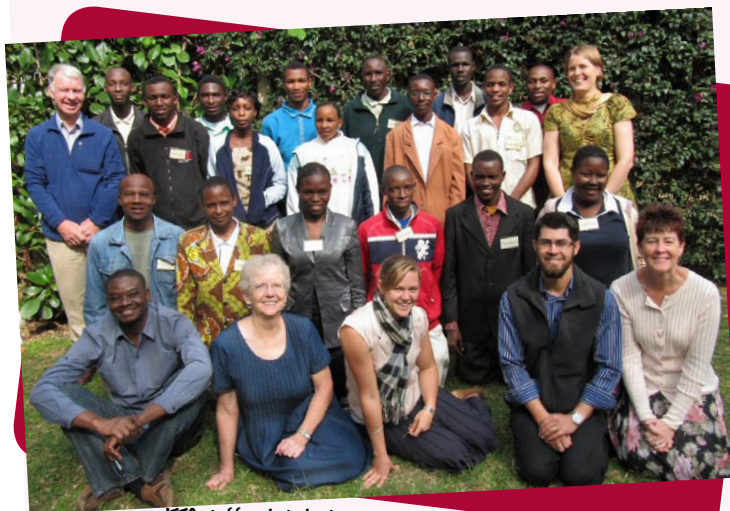
JTTC staff and students

Five of our six mentors are now in Tanzania, with our sixth arriving soon. Mentor training is on the calendar for the last week of August and then mentors and students will be resident in our 3 training schools from early September. We are excited about working with these student teachers in our new mentoring model to see still higher levels of teaching practice in our schools. Meanwhile we have many deadlines to see written units of work completed for students. Writing is going well; editing and finalizing is time-consuming!