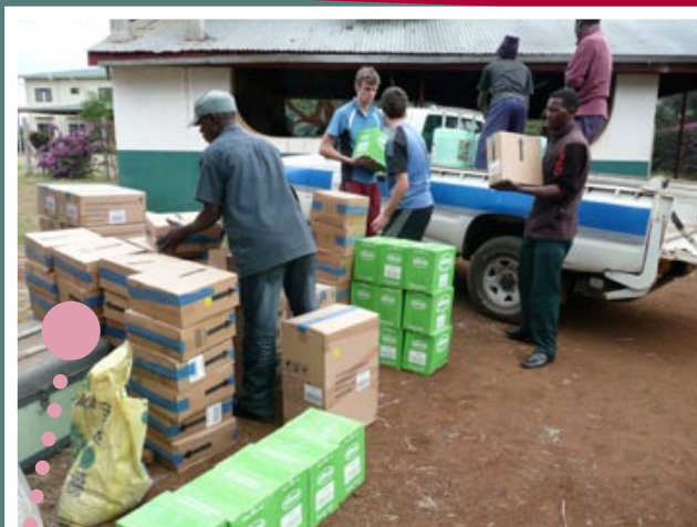
Our first Slime shipment!

We are commencing the development of a business-training curriculum which can educate those interested in running a micro-business with little education. The vision is to have a series of modules that will grow them into successful business people – having an understanding far beyond their current knowledge. This will develop into a Business College in the future, one that can take some of these with little formal education and enable them to study more educated people who desire Kingdom-based business training.