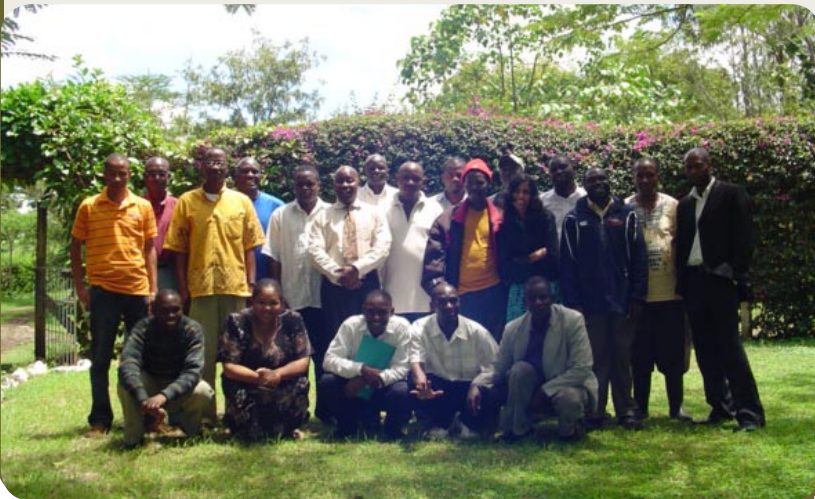
The smaller finishing class of 2010