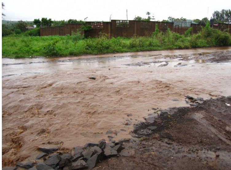
Rain, roads and 'rosion - the river at our driveway entrance!