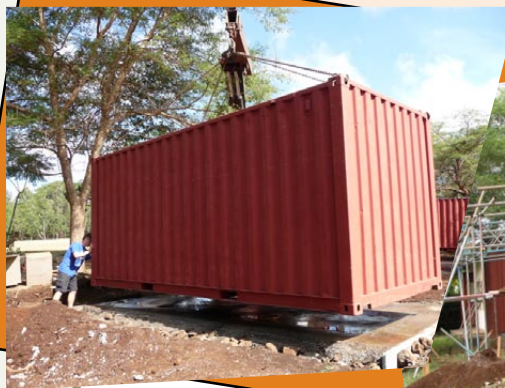
A container becomes a store-cum-classroom wall

We have the framing for 2 new classrooms up, efficiently put together by a team of 5 from the UK. As funds come in we will 'fill in the gaps' so that by next year we can make good use of those teaching spaces.