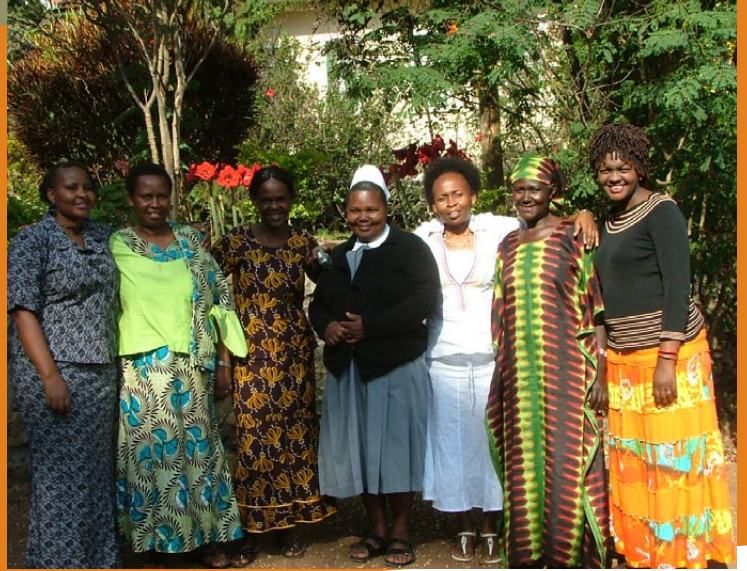
The Women's Ministry Leadership Team

Leaders again met together for the weekend of 8-9th May at En Gedi to prepare for the annual Women's Leadership