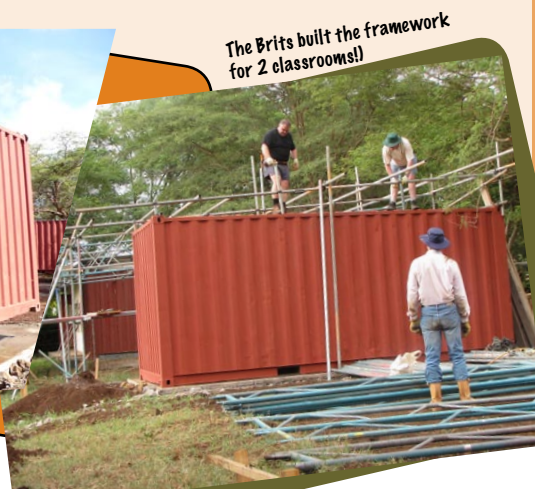
The Brits built the framework for 2 classrooms!