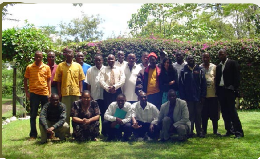
The smaller finishing class of 2010