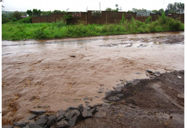
Rain, roads and 'rosion - the river at our driveway entrance!

Pictures: Top left: Renee teaching Farming God's Way to Maasai. Bottom Left and right: Food distribution to poor.