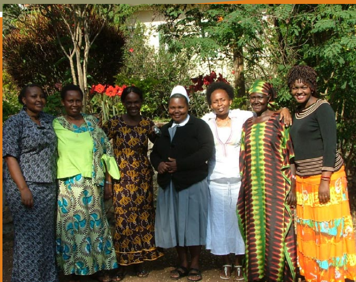
The Women's Ministry Leadership Team

Leaders again met together for the weekend of 8-9th May at En Gedi to prepare for the annual Women's Leadership