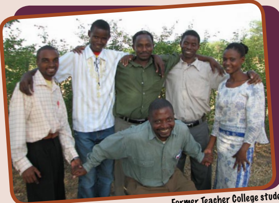
Former Teacher College students

Joshua Teachers Training College – After much deliberation about the future of the college – despite having a superb course on offer – we have decided to change the nature of the course. It will now be conducted largely through a form of distance learning. Student teachers will be placed in schools where they will actively engage with what they are learning on a daily basis in the classrooms, being visited by JTTC staff members every two weeks to mentor them and monitor development. The current challenge is to get all of our current course material down into written form!