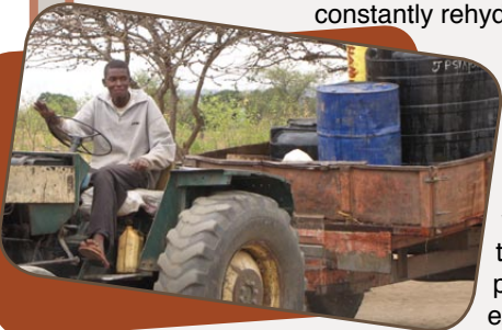
Water is delivered daily by tractor and trailer to school

Please also be praying for our Standard Four class: this year will be the first year that a class in our primary school has sat examinations in English.