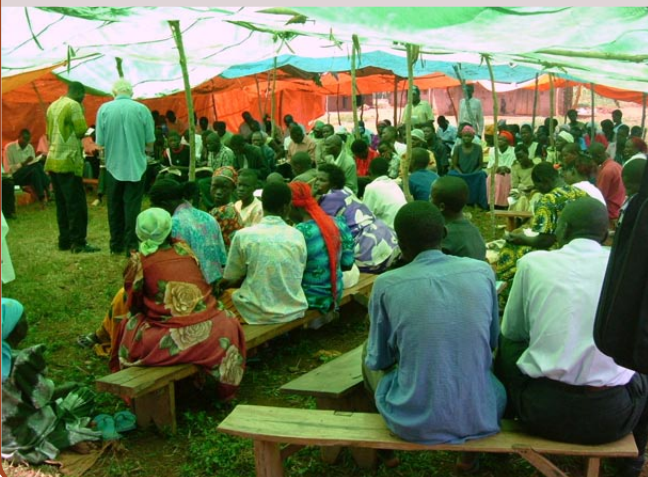
Owen under Plastic: training leaders under plastic

The global recession combined with poor rains has greatly complicated the cash available to these leaders to enable them to continue their training and provide for their families. As a result the August–November module has some unoccupied places. This is sad and frustrating as the theme for this module of 'Church Growth and Strongholds' carries many vital keys to effective ministry, particularly focused on the African situation.