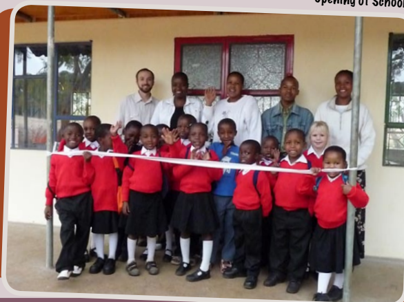
Opening of School

Joshua Teachers Training College – After much deliberation about the future of the college – despite having a superb course on offer – we have decided to change the nature of the course. It will now be conducted largely through a form of distance learning. Student teachers will be placed in schools where they will actively engage with what they are learning on a daily basis in the classrooms, being visited by JTTC staff members every two weeks to mentor them and monitor development. The current challenge is to get all of our current course material down into written form!