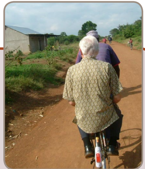
Determined Missionaries use any means to get to their appointment!

While working on these challenges we continue to be greatly encouraged from the reports and testimonies received here of the effectiveness of the training programme. The