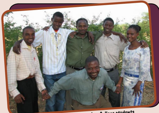
Former Teacher College students

Joshua Teachers Training College – After much deliberation about the future of the college – despite having a superb course on offer – we have decided to change the nature of the course. It will now be conducted largely through a form of distance learning. Student teachers will be placed in schools where they will actively engage with what they are learning on a daily basis in the classrooms, being visited by JTTC staff members every two weeks to mentor them and monitor development. The current challenge is to get all of our current course material down into written form!