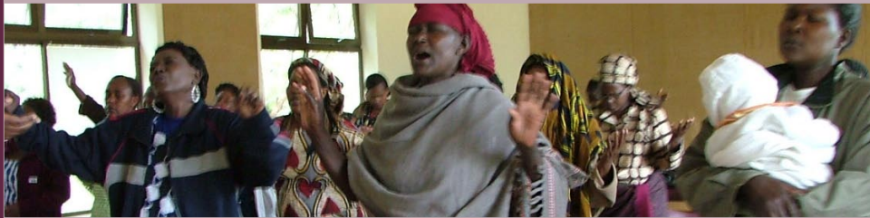
Praising Jesus at the Women's conference