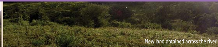
New land obtained across the river!