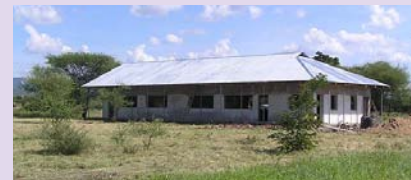
New JSS classrooms

An unexpected demand from the government has meant that we will start JSS with 2 streams ie 60 students ... twice as much impact as we had planned to make!