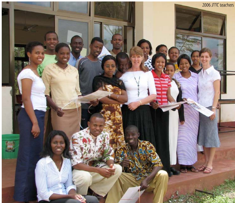
2006 JTTC teachers