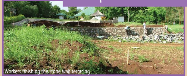
Workers finishing the stone wall terracing

The Joshua Foundation Newsletter November - February 2007