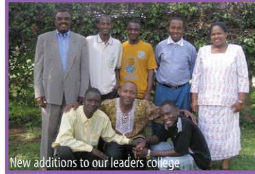
New additions to our leaders college