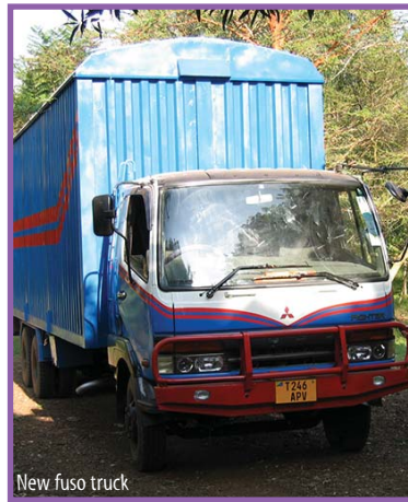
New fuso truck