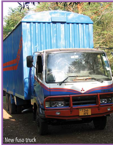
New fuso truck