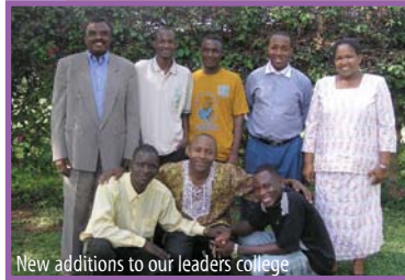
New additions to our leaders college