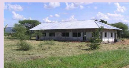
New JSS classrooms

An unexpected demand from the government has meant that we will start JSS with 2 streams ie 60 students ... twice as much impact as we had planned to make!