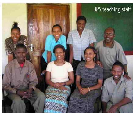
JPS teaching staff

The beginning of 2007 sees plenty of action on the education front, even though a lot of it is still preparation work.