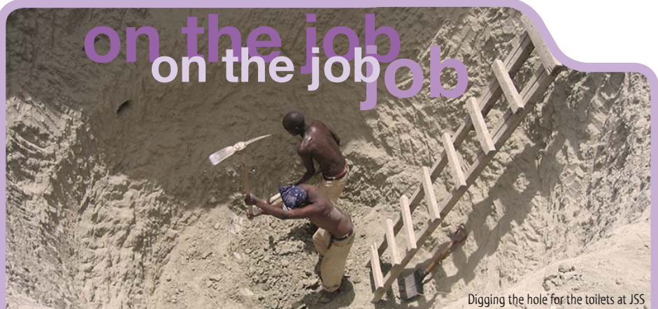
Digging the hole for the toilets at JSS

Wow, things have not slowed down at all over here! It has been exciting to oversee the two new classrooms being built for the Joshua Secondary School (JSS) at Magugu and things are looking good to be completed before due date.