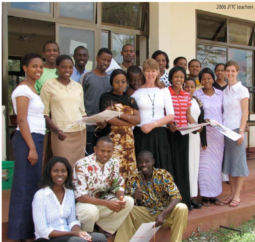
2006 JTTC teachers