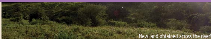
New land obtained across the river!