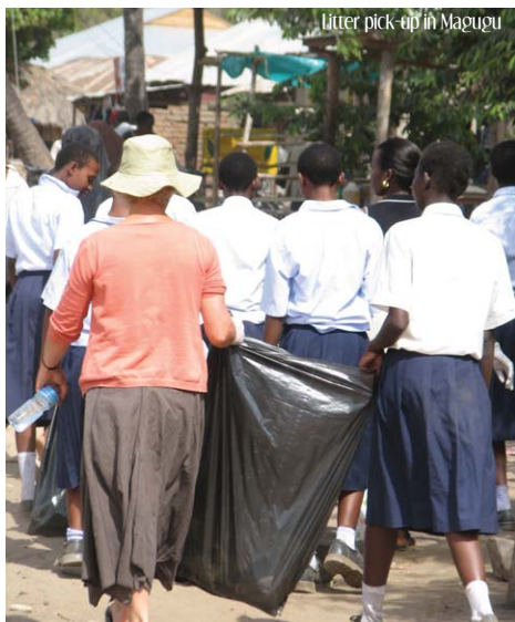
Litter pick-up in Magugu