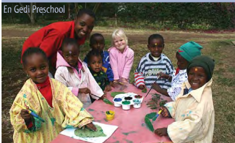
En Gedi Preschool