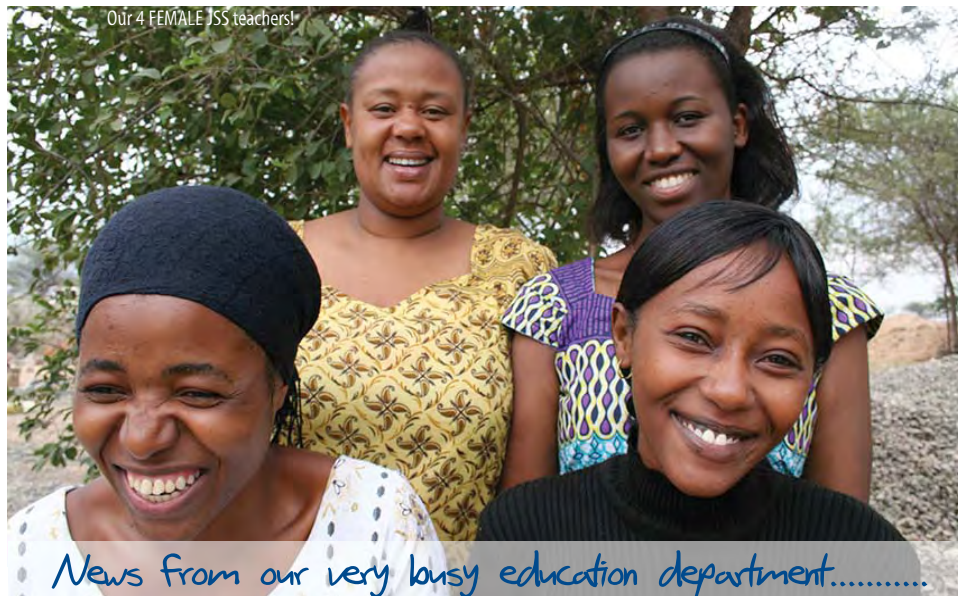
News from our very busy education department.....

Joshua Secondary School: A government official has said that JSS has no maths teacher - ??? OH, that's because all our teachers are women, and women can't teach maths!! Strangely enough our students performed extremely well on a recent area maths test.....mmmmm!