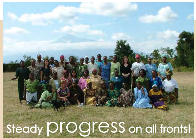
Steady progress on all fronts!