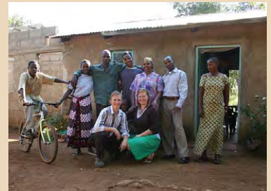
May - July 2007