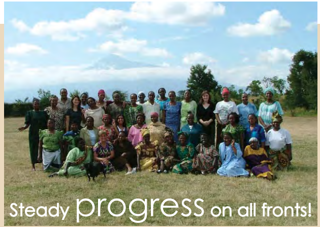
Steady progress on all fronts!