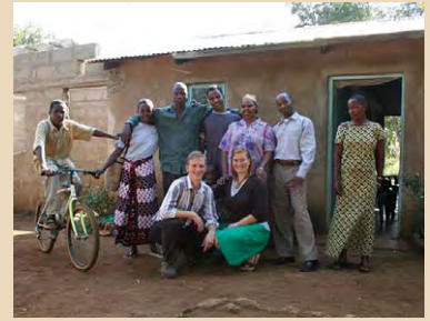
May - July 2007