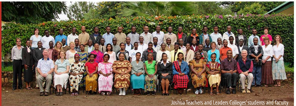
Joshua Teachers and Leaders Colleges' students and faculty

Questions galore! That has been the mark of this module as an intake of about 10 new participants to the Leadership course have been processing so many new concepts.