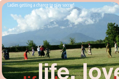
Ladies getting a chance to play soccer!

God is releasing these precious ladies into His love and life