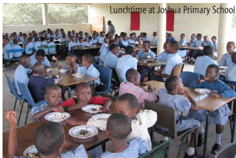
Lunchtime at Joshua Primary School

Joshua Schools Magugu are becoming a force to be reckoned with!! With 52 preschoolers, 235 primary and 61 secondary schoolers we have a grand total of 348 students to immerse in Godly education every day of the week!