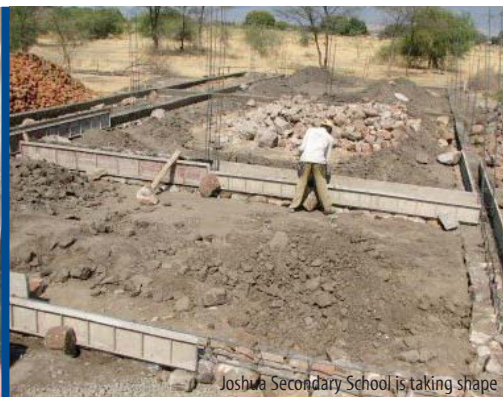
Joshua Secondary School is taking shape