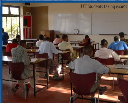
JTTC Students taking exams