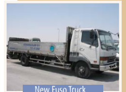
New Fuso Truck

The Colleges' campus is now being expanded with the terracing of our 4-acre mid-section block, thanks to a donation from the U.K. (Visitors continue to prove that for many, "seeing is believing" – and that a trip to The Joshua Foundation is