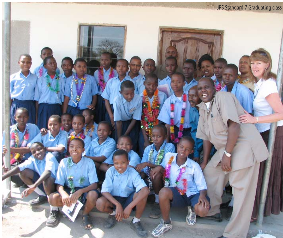
JPS Standard 7 Graduating class