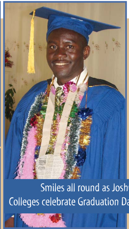
Smiles all round as Joshua Colleges celebrate Graduation Day!