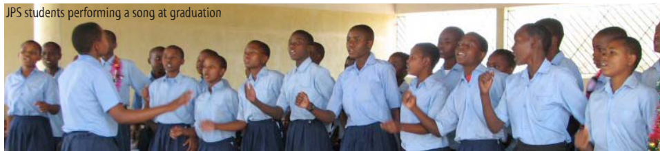
JPS students performing a song at graduation

We are also in the process of selecting our next intake of students for Joshua